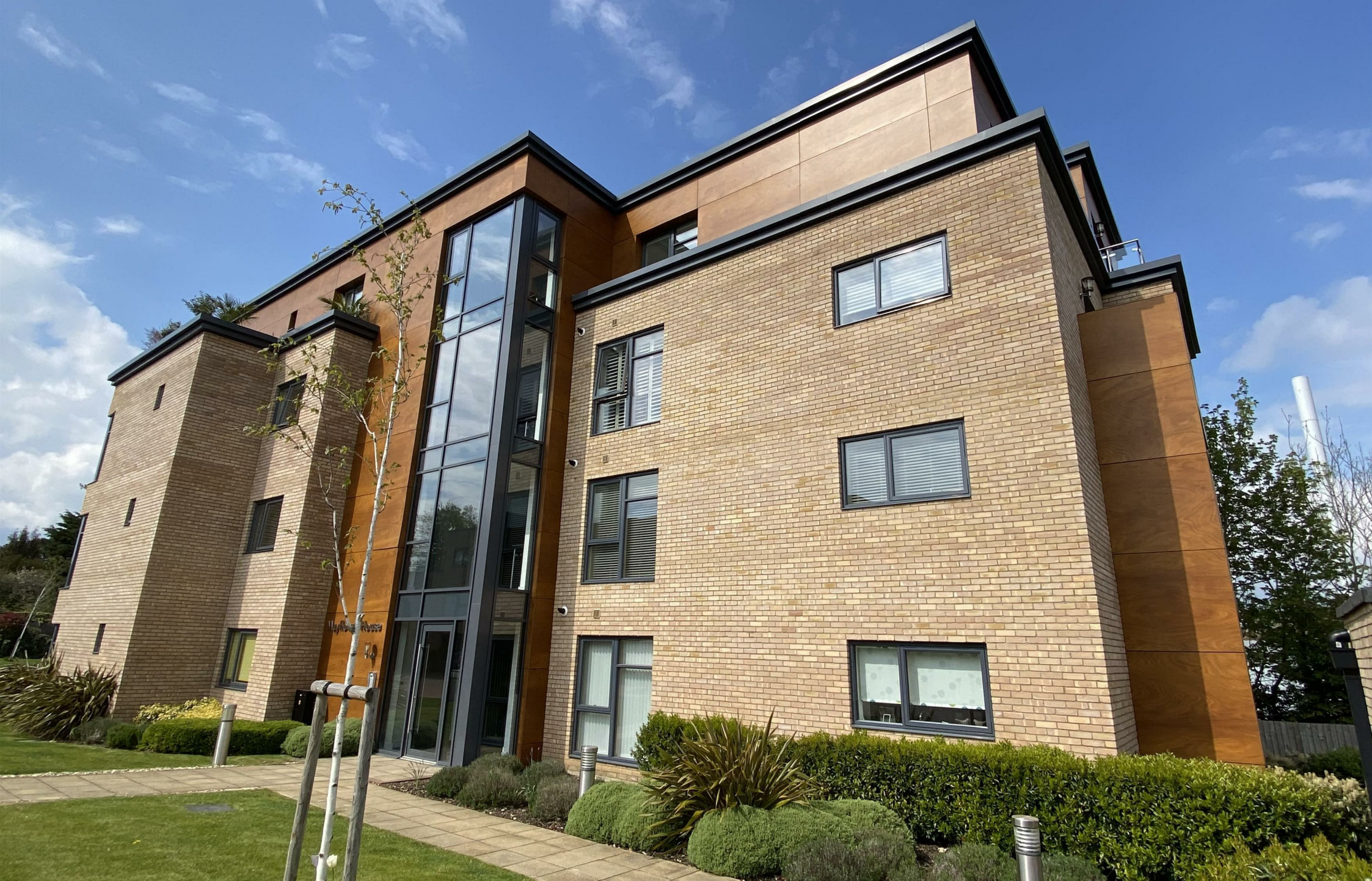
11 Mayflower House Leckhampton Place, , Cheltenham, GL53 0FB