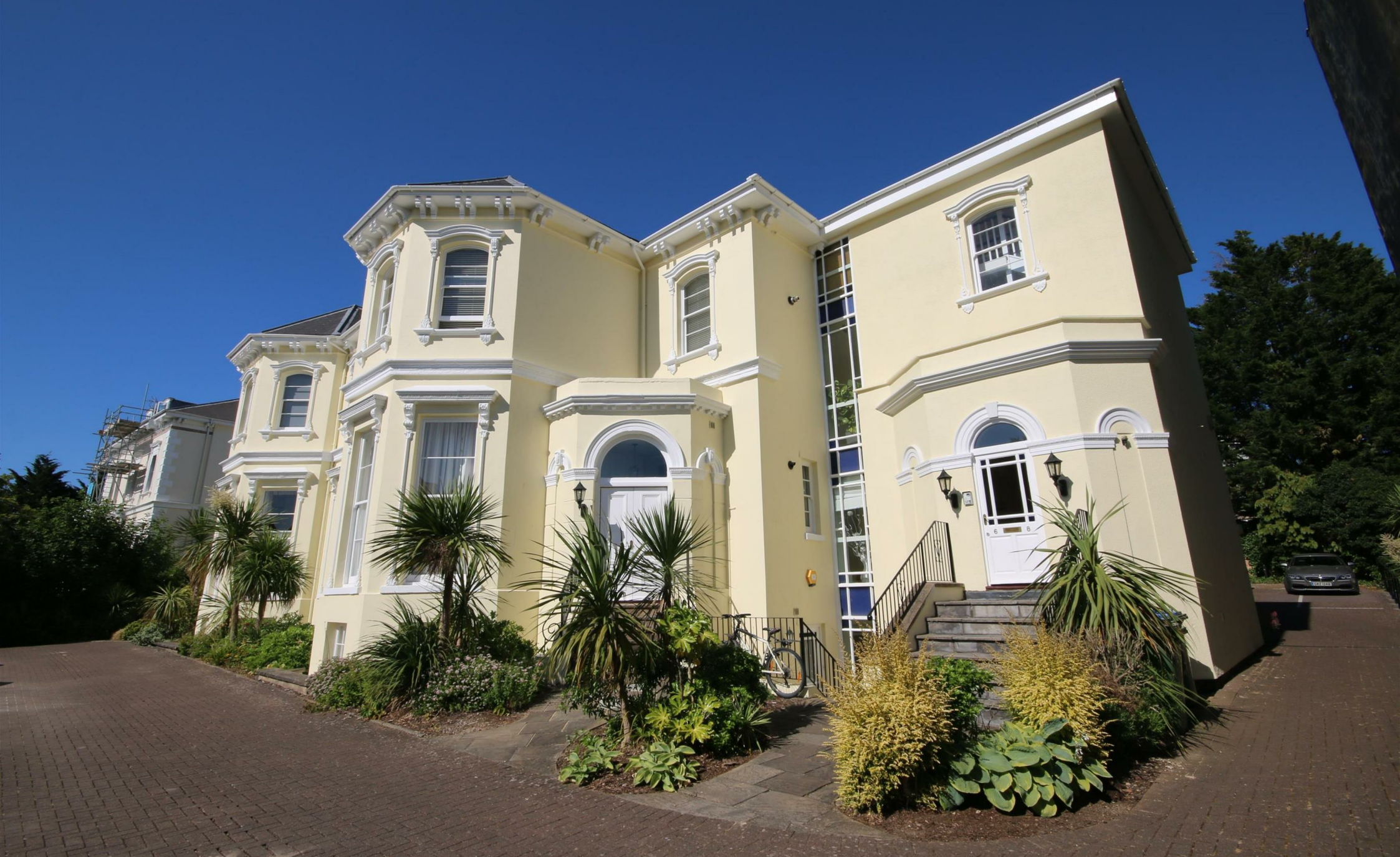
2 Victoria Mansions, Malvern Road, Cheltenham, Gloucestershire, GL50 2JH