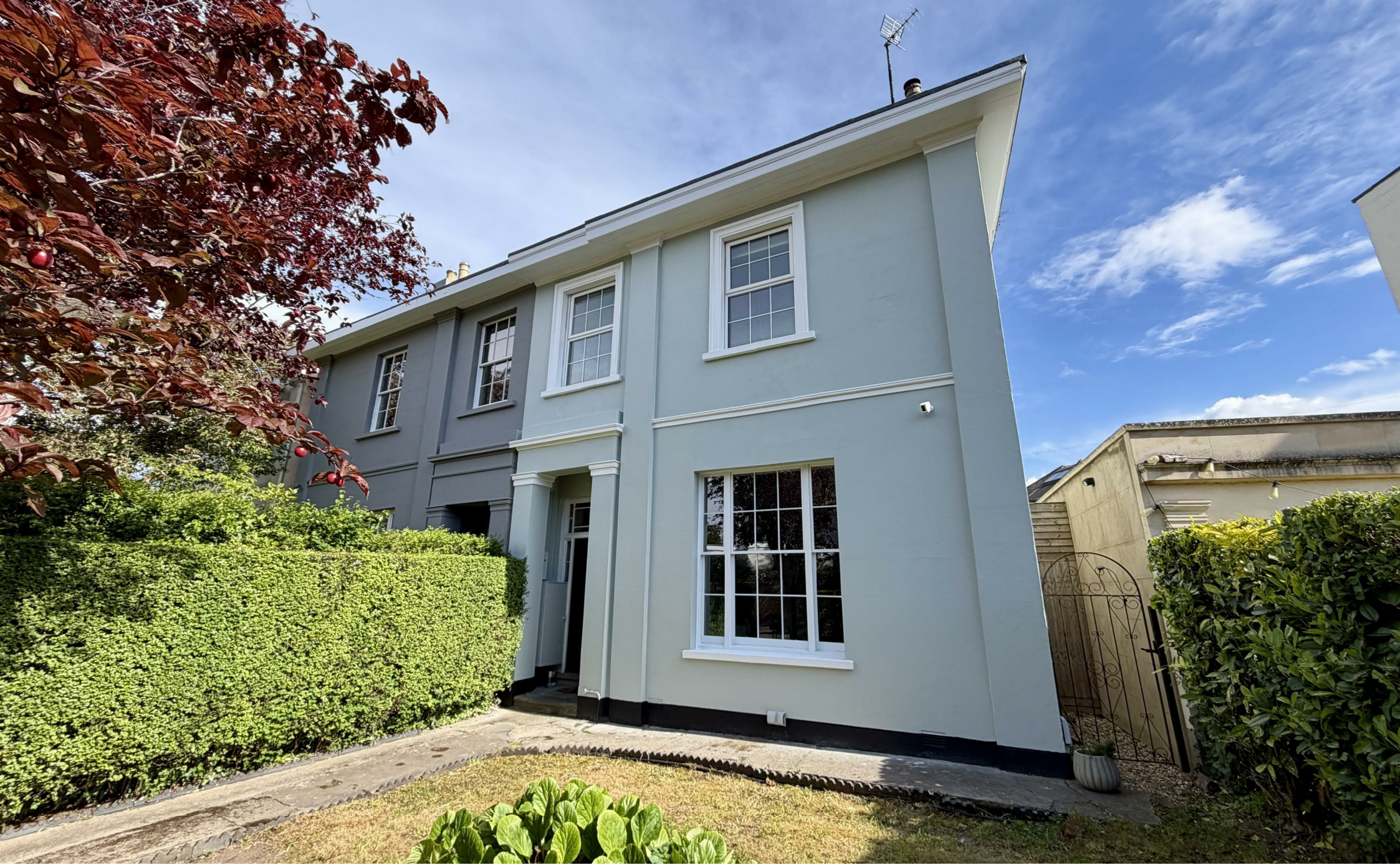
TAUNTON VILLA, 90 SUFFOLK ROAD, CHELTENHAM, GL50 2SZ