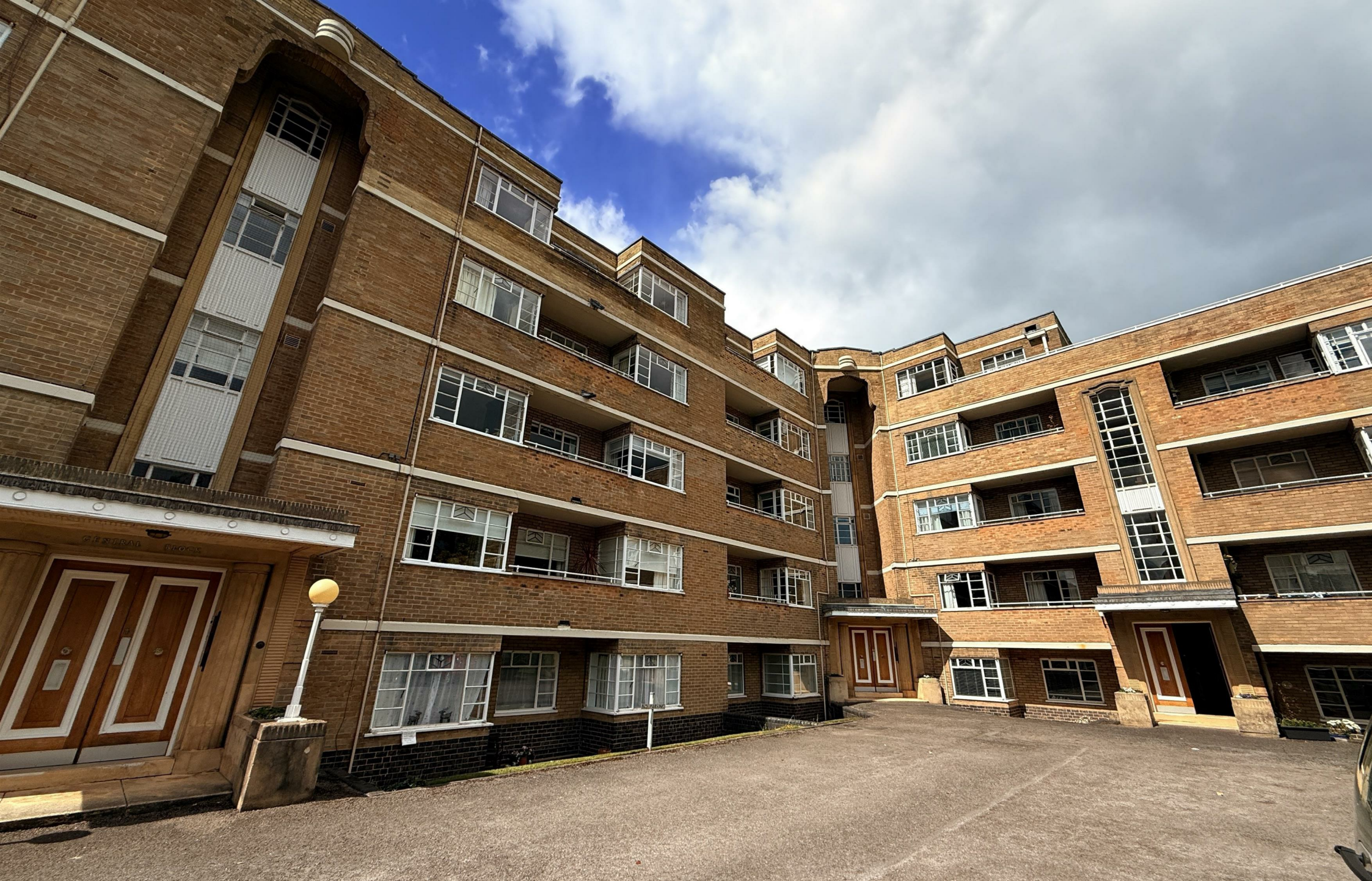
FLAT 1, SUFFOLK HOUSE WEST SUFFOLK SQUARE, CHELTENHAM, GL50 2HR