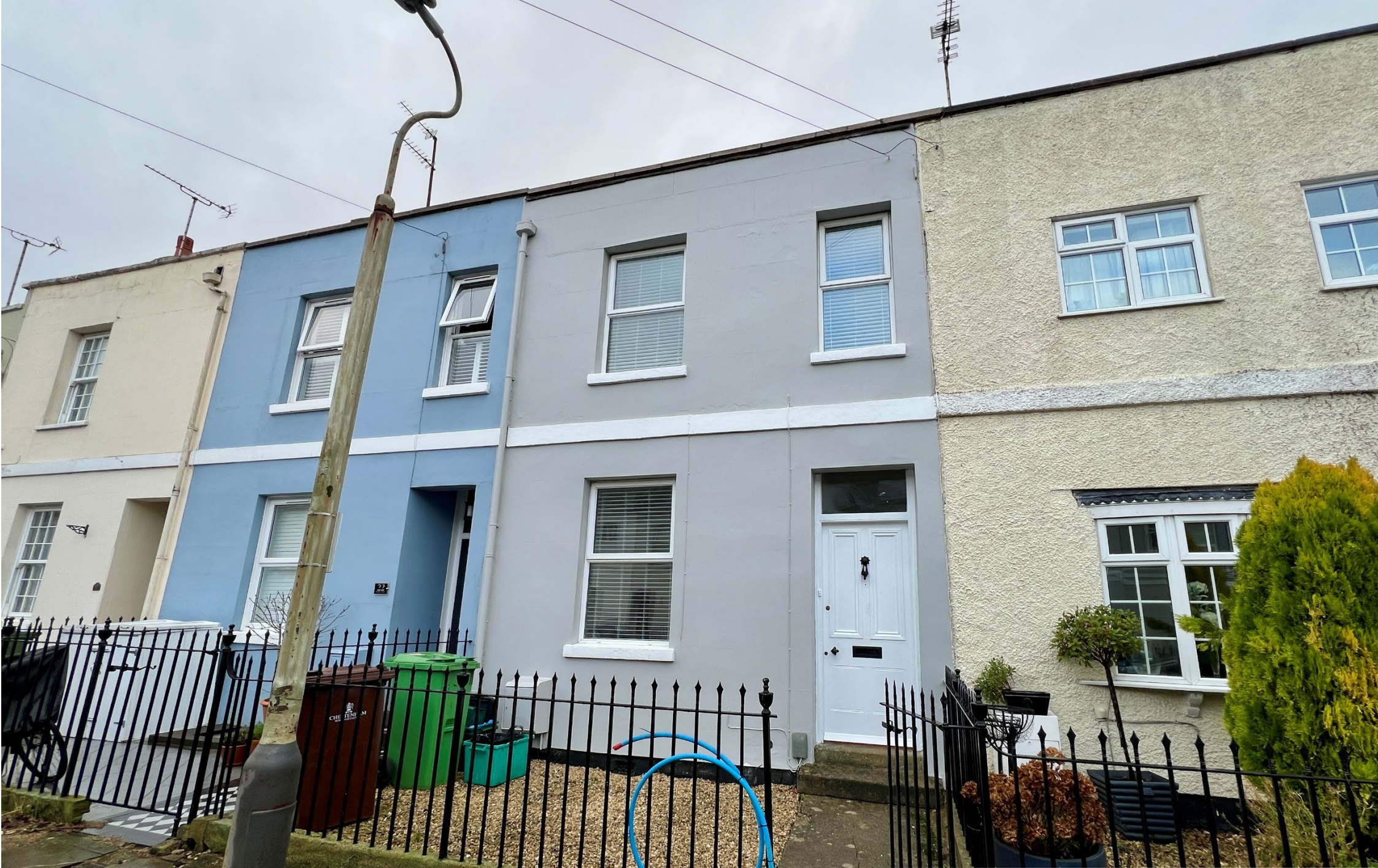
24 Dagmar Road, Tivoli, Cheltenham GL50 2UG