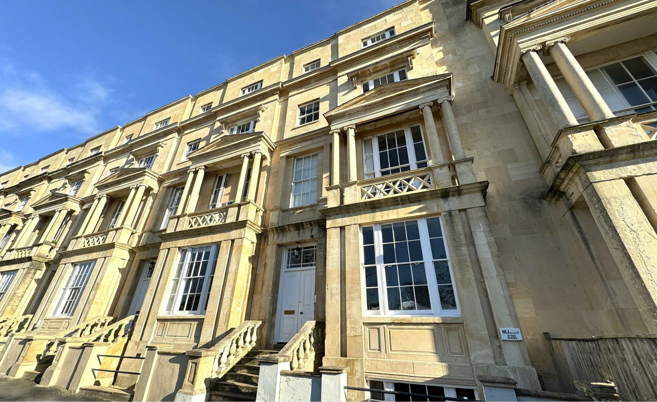
3 Evelyn Court, Malvern Road, Cheltenham, Gloucestershire, GL50 2JR