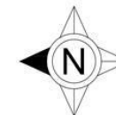
Illustration for identification purposes only, measurements are approximate and are not to scale. Please check all details before making any decisions reliant upon them. (ID1309413)

Approximate Gross Internal Area = 1022 sq ft / 95.0 sq m