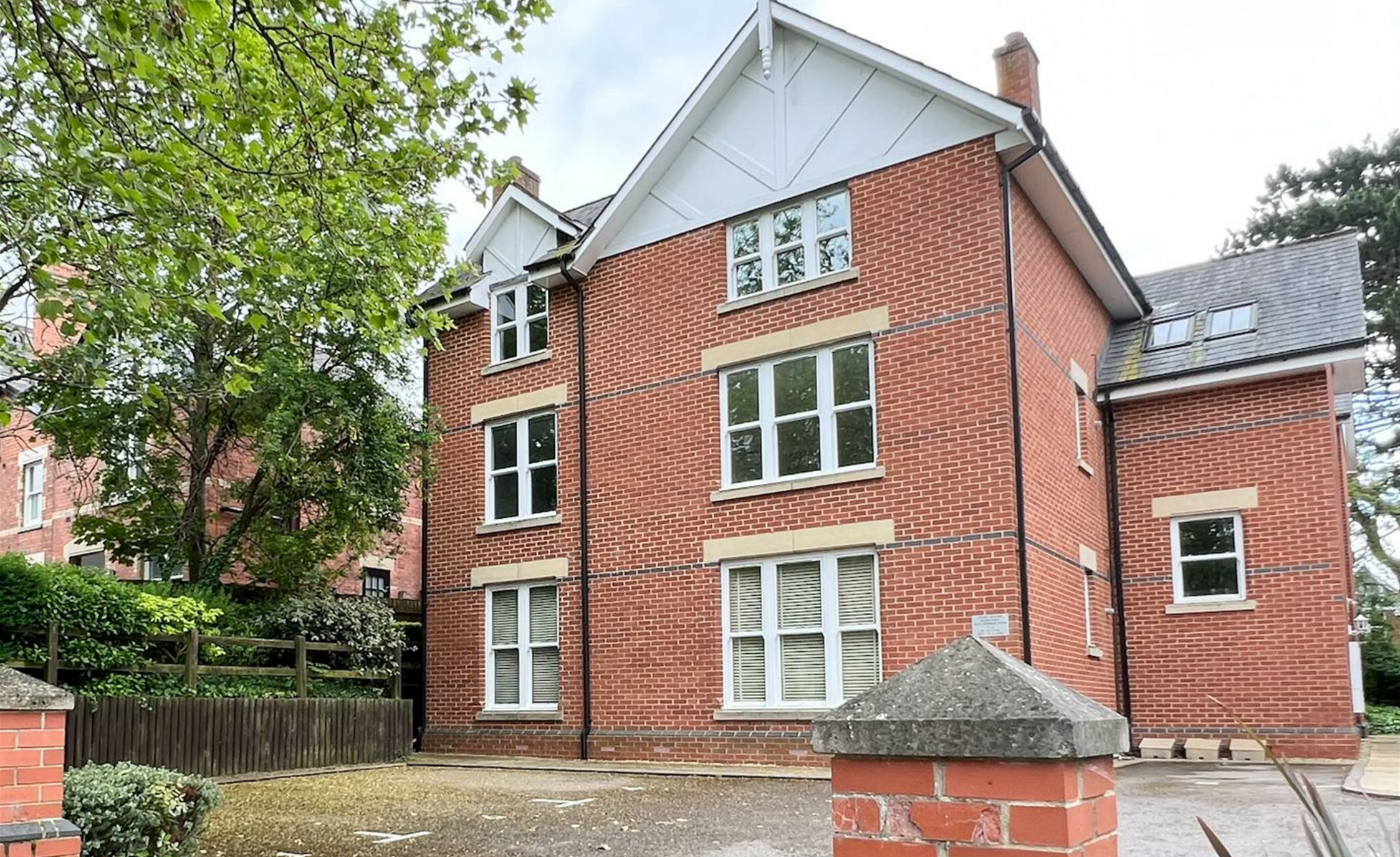
Flat 4 Hazelhurst 24 Eldorado Road, Cheltenham, Gloucestershire, GL50 2PT